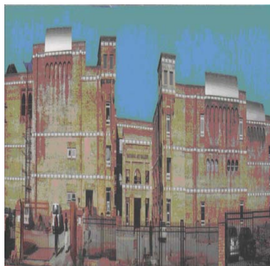
National Art Gallery